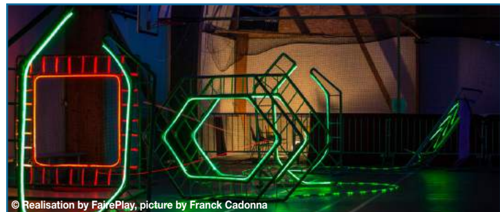
© Realisation by FairePlay, picture by Franck Cadonna

* In complete darkness, illuminated only thanks to a decoration of led lights.