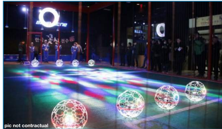
pic not contractual

https://www.youtube.com/watch?v=Zf7w8Oh1AnE