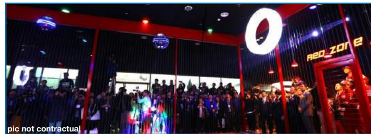
pic not contractual

http://www.kwangju.co.kr/read.php3?aid=1534863600639381168